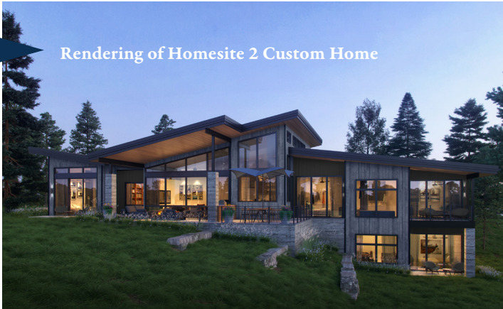
Rendering of Homesite 2 Custom Home